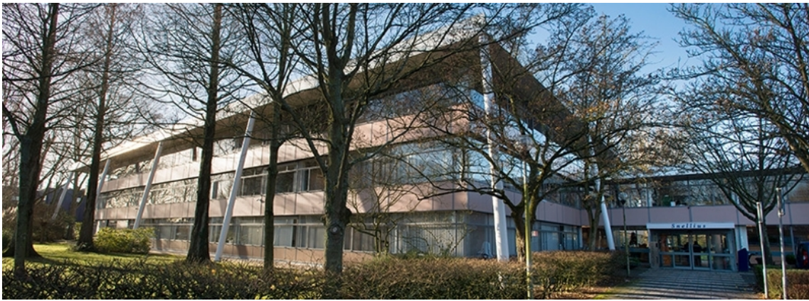
Figure 3: Snellius, Leiden University