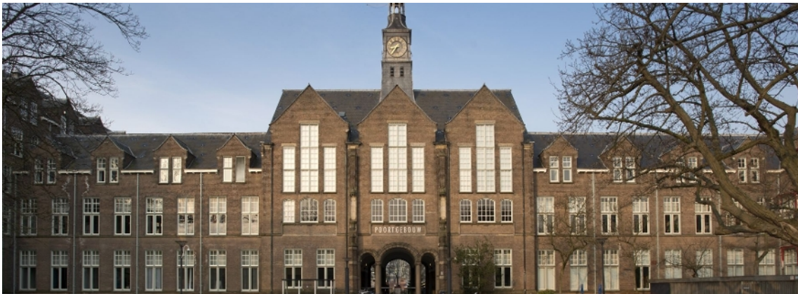
Figure 4: Poortgebouw, Leiden University