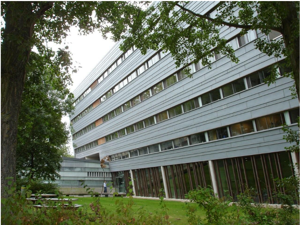
Figure 2: Huygens Lab, Leiden University